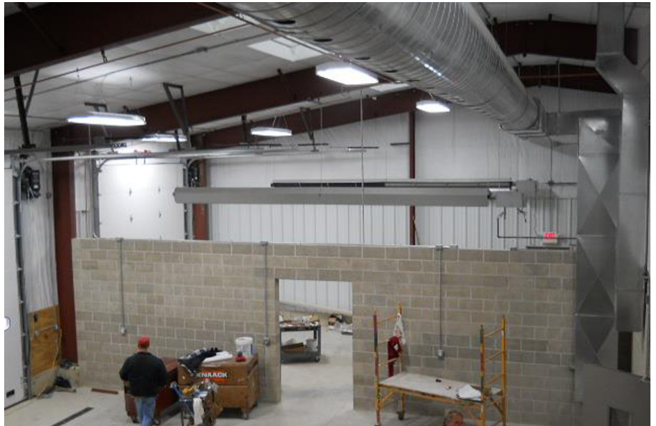
One of three maintenance bays