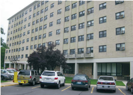
Oak Towers above; Paquin Tower below